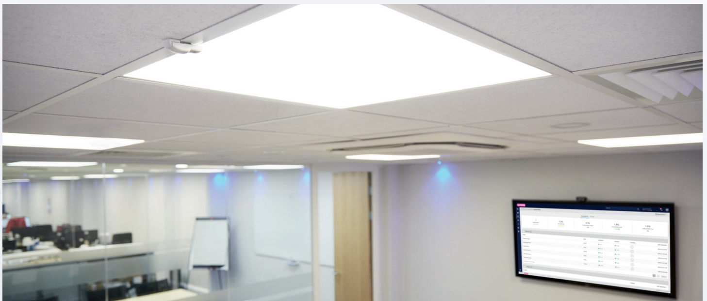
G-90-0019 Rev A